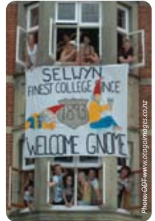
Proud residents of Selwyn College

For many Otago students, halls of residence (or 'Colleges') are the first taste of what is in store for them over the coming years. Halls provide comfortable surroundings for first year residents with enough supervision to keep 'the olds' happy. That doesn't stop freshers having a great time making new friends, facing new challenges, and having fun! The year starts with Orientation Week. In between pesky stuff like course approval and preliminary lectures, students will attend concerts, parades, toga parties and movie screenings, largely run by the Otago University Students' Association. The rest of the year sees classes, internal assessment and stressful exams surrounded by concerts, parties, rugby games and other organised events. It goes without saying that this year passes in a blur for many students!