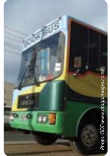
The Bookbus today

The Library has occupied its present location on the northern side of Moray Place since 1981. The Library's popular Bookbus undertook its first distribution run on 17 April 1950. A second Bookbus was added in 1976 and today they call at 51 stops throughout the city.