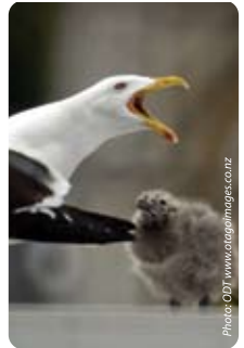
A Black-backed gull sounding the alarm

Seabirds that occasionally visit Otago include the mollymawks, prions, petrels and shearwaters (muttonbirds). As they feed exclusively at sea, these birds are best viewed from boats but sometimes come close enough to the shore for the keen bird spotter to see.